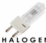
HA LO GEN